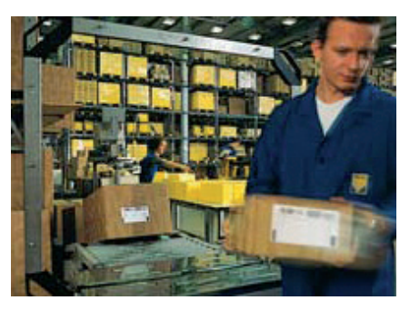
Manual Postal sorting